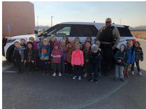
DOUGLAS COUNTY DEPUTY