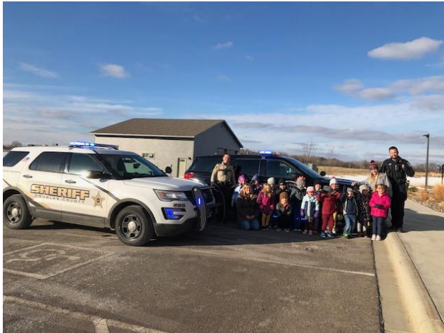
ALEXANDRIA POLICE OFFICER